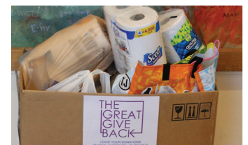
Great Give Back Page 8

451 Delaware Ave., Delmar • 518-439-9314