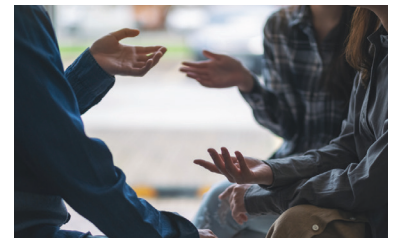
Language Exchange Page 3