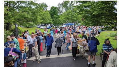
Friends Book Sale Page 2