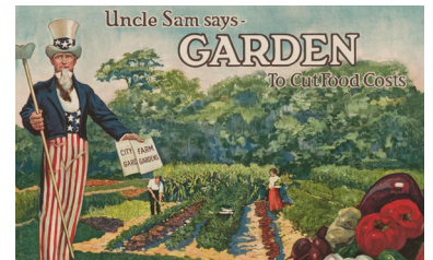
Victory Gardens Page 4