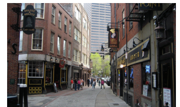
Boston Bus Trip Page 8